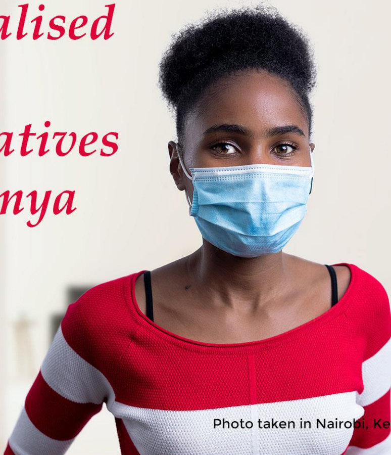
Photo taken in Nairobi, Kenya